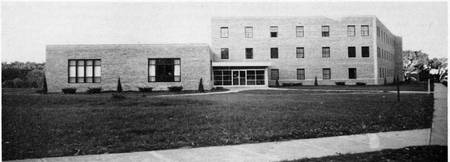
Much of the social life of the campus centers around the new Student Union, which contains a snack bar, television room, ping pong room, lounge