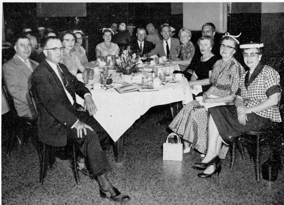
The class of 1931 at the Reunion Luncheon.