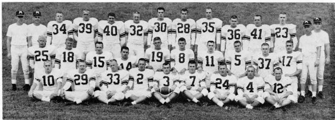
The 1959 Maroon Chiefs

Playing for the first time under the banner of the Maroon Chiefs (see story), the 1959 Morningside football squad opened the season September 12 at home against Central Missouri.