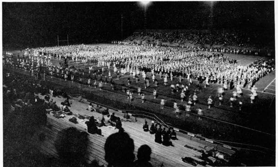
Fifty two high school bands from a radius of 150 miles joined with the college band to change the football field into a highly colored spectacle, on the occasion of Morningside's third annual Band Day on October 1.