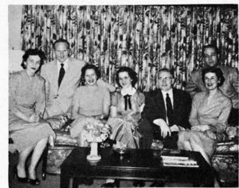
REUNION GROUP IN OMAHA