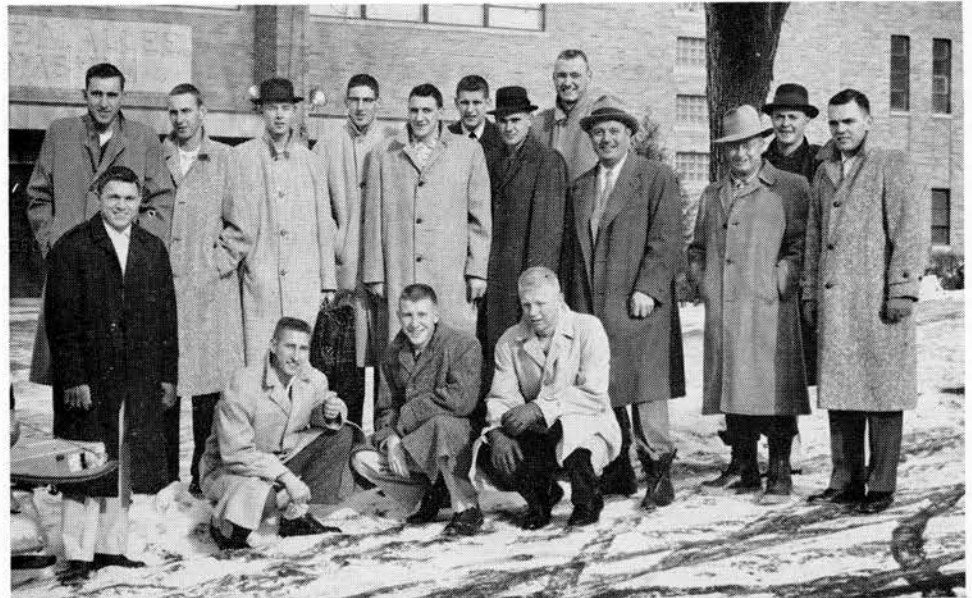
Basketball Squad Leaving For The South

The Roadmans are working in cooperation with the Schilling Tours service of Minneapolis.