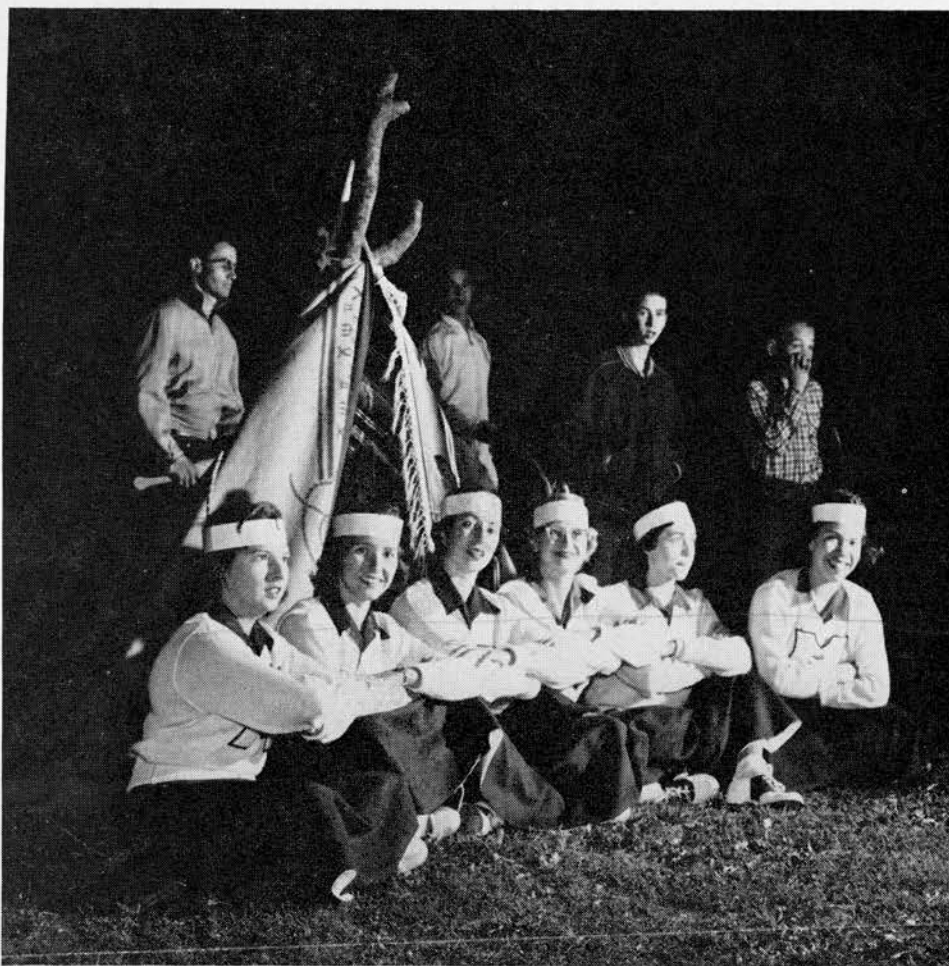
TRIBE OF THE SIOUX WELCOMES YOU ON ALUMNI DAY, JUNE 2

Listed below are the alumni who have been nominated in the primary voting for the third annual Alumni Achievement Awards.